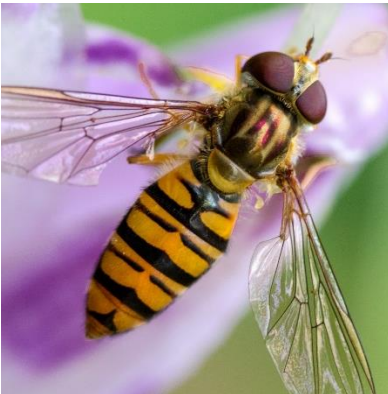
900 hoverfly species