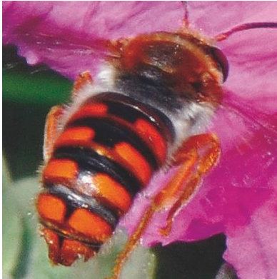
2,000 bee species