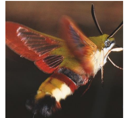
8,000 moth species