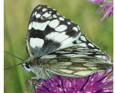
500 butterfly species